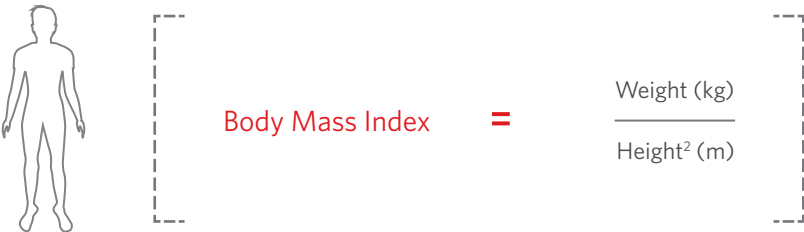
Figure 3: BMI formula

A male client who is 1.81m tall and weighs 102kg has a BMI of 102/1.81^2 = 31.1 , qualifying for a 2.5% discount on the medical rating factor.